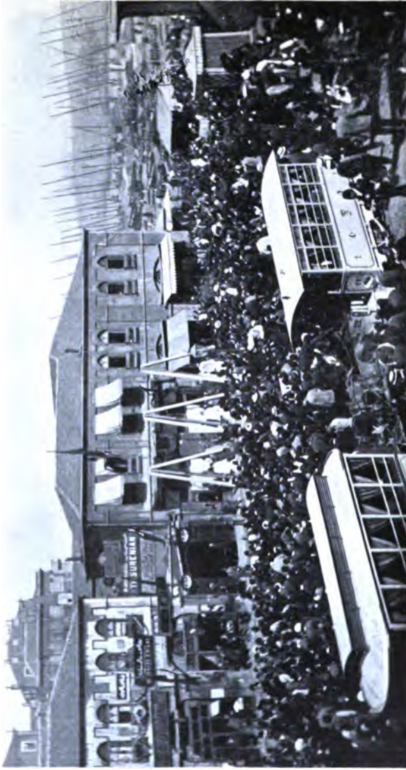
NEMESIS! Three mutineers on gallows in the streets, April 1909